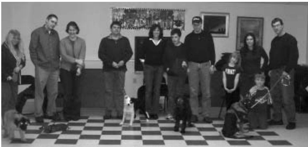
Basic Obedience Graduates

A lot of can things happen in an obedience course. Through the length of a typical 6week course a dog and their companion may actually learn to communicate with one another. A human may learn what a dog is actually trying to tell them. A dog may learn to respond to some verbal commands that produce enthusiastic responses from their humans, not to mention some very tasty treats too! Dogs may learn to act appropriately in public, and no longer embarrass their humans. Humans may also learn how to act appropriately in public with their dog and may no longer repeat things over and over and over again while jerking the dog's leash.