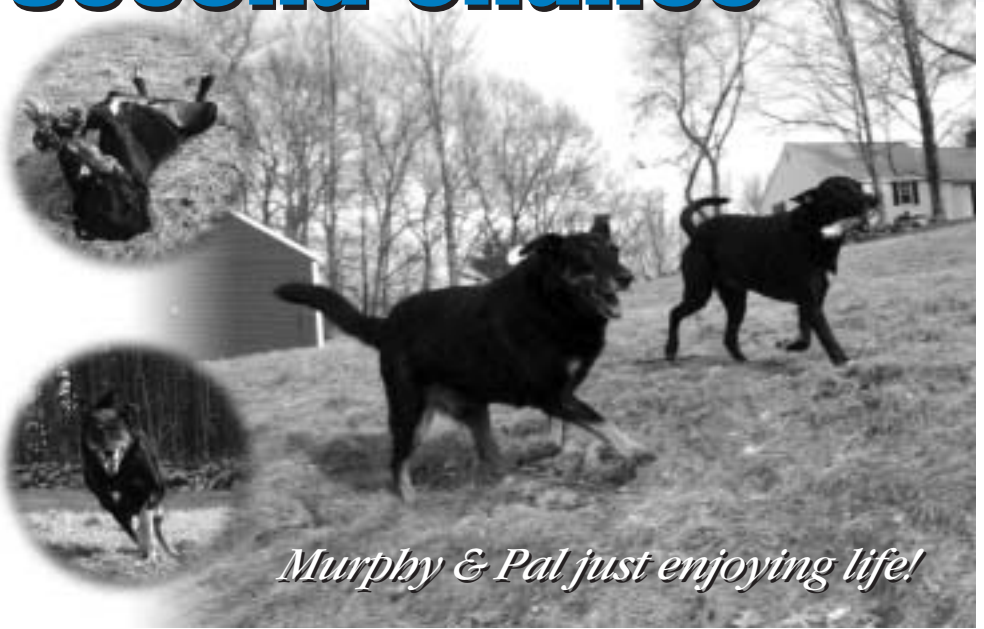
Murphy & Pal just enjoying life!

A few minutes later she gave me food and water and put a blanket out for me. It was getting dark so I laid on the blanket all night. In the morning the lady came outside and gave me more food. I was very happy and decided to follow her everywhere. She went to her car and I followed. In a few minutes we were at a