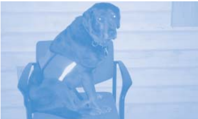
Molly the dog, ready to educate

These presentations are offered to the community free of charge. If you would like to support the future of this important program financially, please contact Marianne at 603.472.DOGS (3647) , send a donation to our address with a note saying you'd like your gift to support the education program.