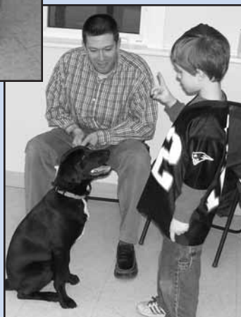
Sit Remy! Sit!