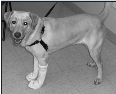
Fun In Obedience Class

Training a dog shouldn't just include teaching the physical commands such as 'sit' or 'stay', but should also include getting them used to everyday handling and to be more tolerant of you as you try to keep them healthy and happy for a long time to come.