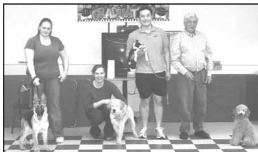
Puppy Graduation Photo